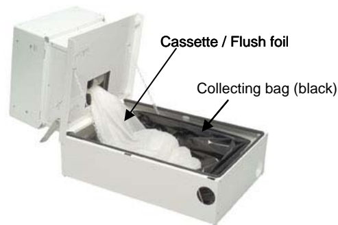
How to empty latrin waste from Podium.